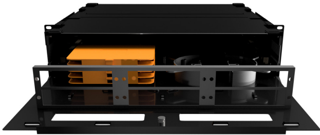
Enclosures are sold empty, front view.